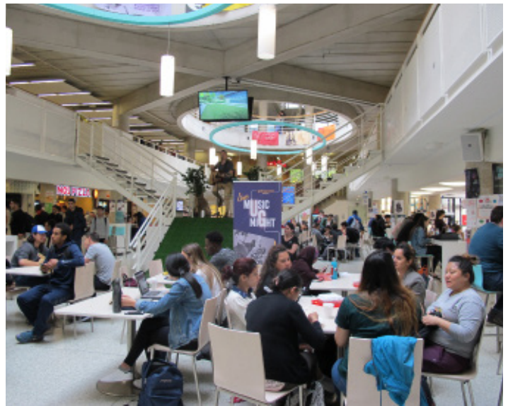
Name of event: Music in the Park Date: September 20, 2023 Location: First Student Centre