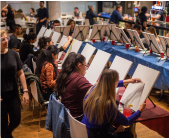
Name of event: Cocktails and Canvas Date: November 7, 2023 Location: The Break Room